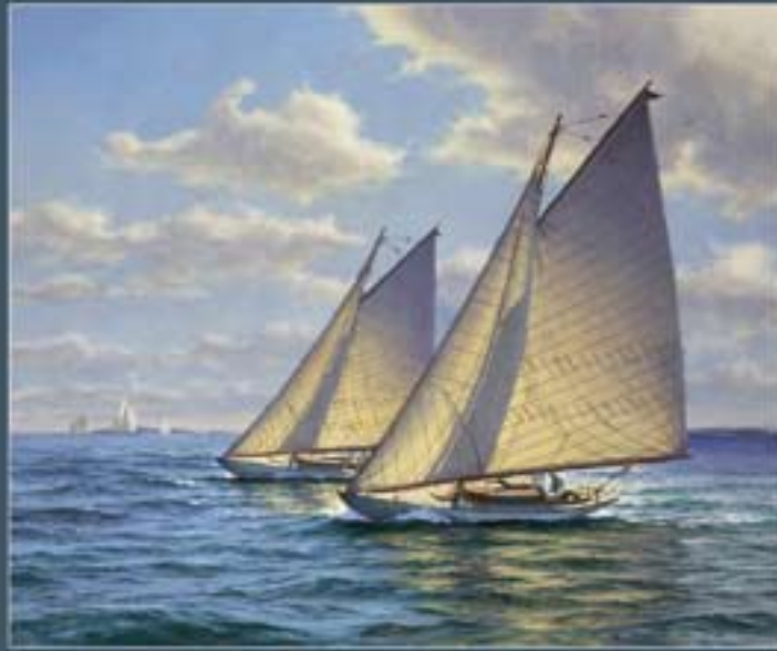
Breeze on the Bay by Donald Demers